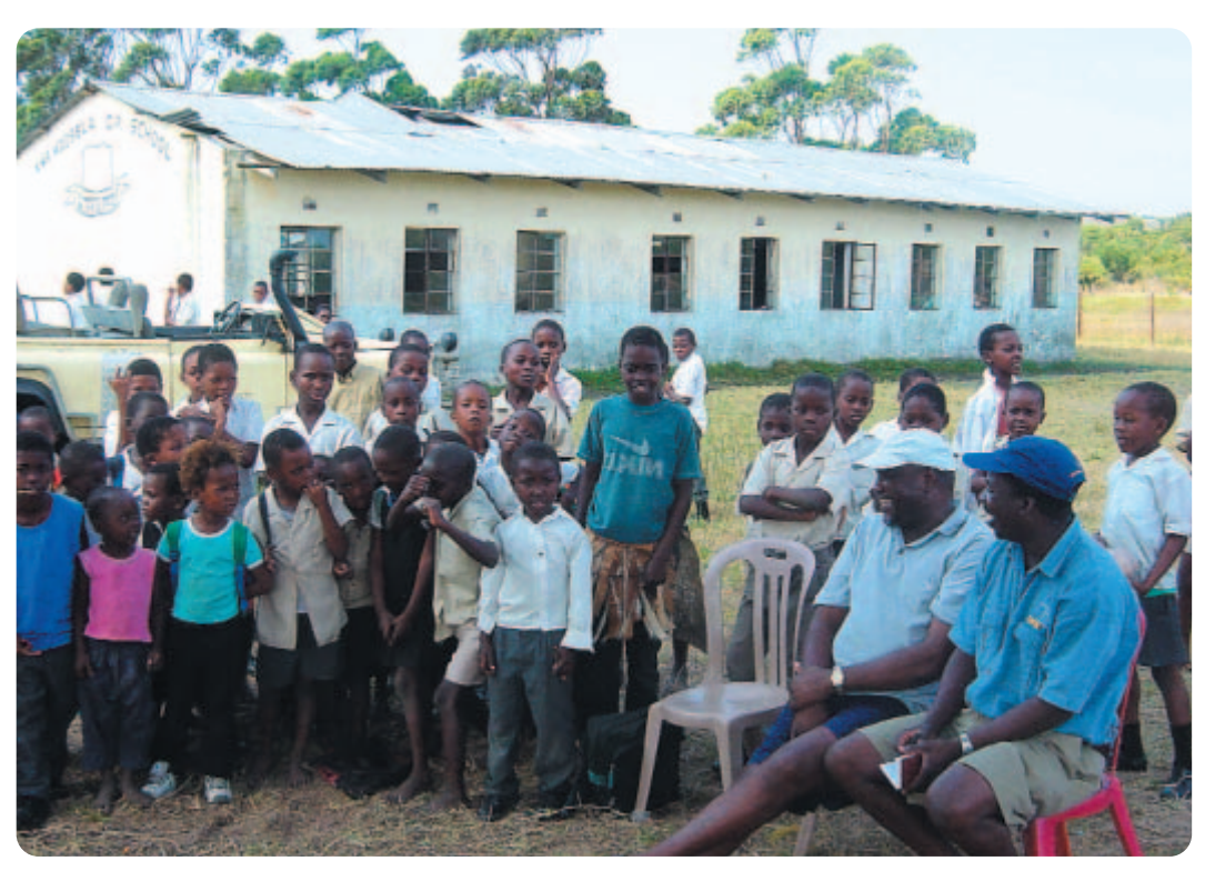
Visiting Mgobela school near Rocktail Bay lodge.