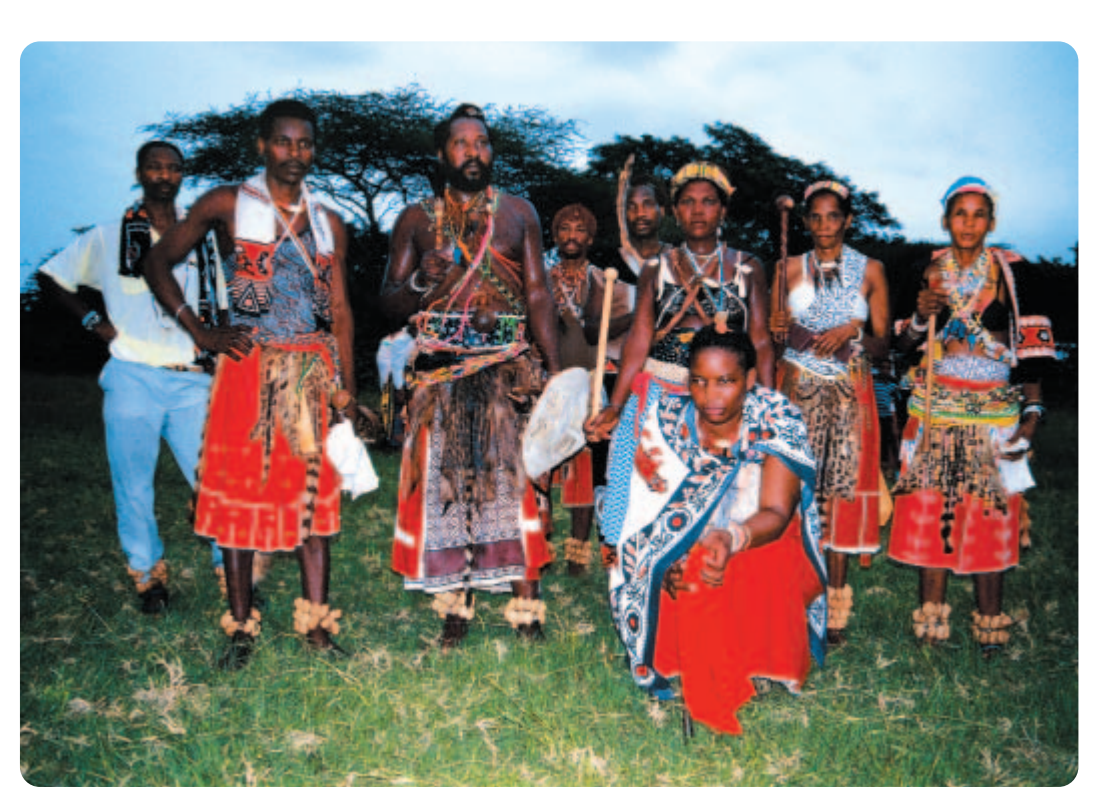
Izangoma participating in the Sangoma Safari in Maputaland.