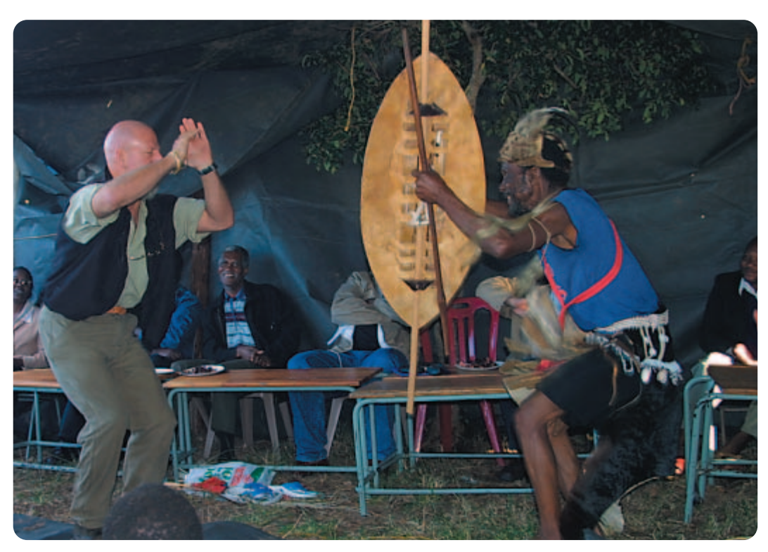
PPT facilitator invited to join in Zulu dancing at Mgobela.