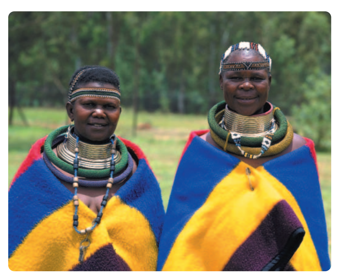
Ndebele woman with traditional gear.

Those who have the greatest cultural and historical knowledge are often those with least business experience, and least opportunity to set up in tourism. In order to produce a quality cultural experience it is almost obligatory to form some kind of partnership with local communities, Brief 3 . Although there is a risk of failure, partnerships can be very successful and dynamic.